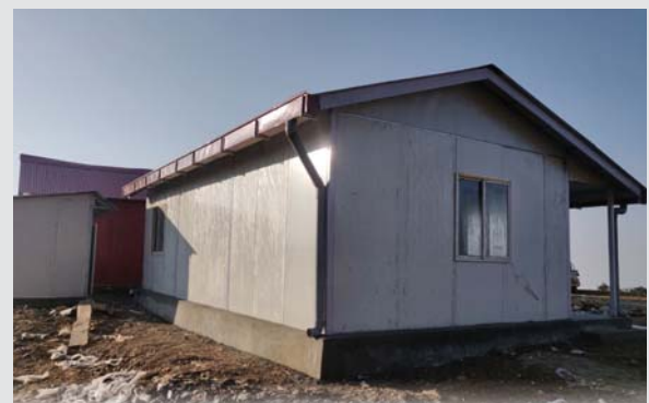
Patle Clinic Building Construction.