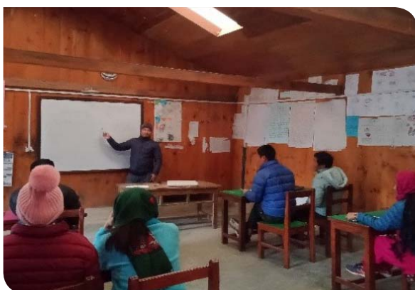
SBTTP team facilitating on evaluation technique grade 4-8 Saraswati BS, Phuleli.