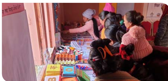
Participants' observing readymade ECED materials before beginning of technical session.