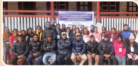
Training participants, guests and trainers in Junbesi Secondary School.

The objective of the training was to build the capacity of ECED teachers in facilitating classes in line with the government-mandated curriculum. The training is part of the Quality Education Programme in Solukhumbu (QEPS) supported by New Zealand Aid Programme and Himalayan Trust New Zealand.