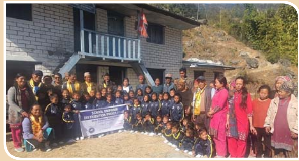
Group photo of guests, students, teachers and parents.