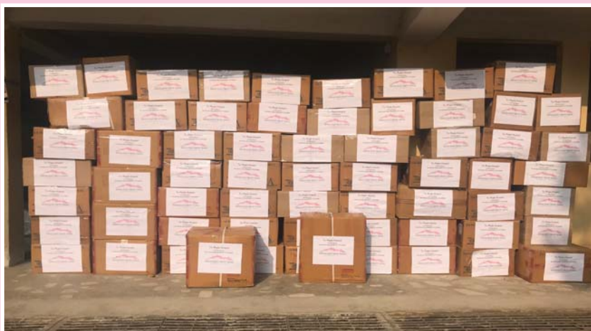
Drugs of Phaplu hospital.

HTN procured the necessary drugs for Phaplu hospital, Bung and Salyan clinics, and delivered them to the hospital and clinics in February as part of its regular support. The cost of the drugs was supported by Sir Edmund Hillary Stiftung, Germany.