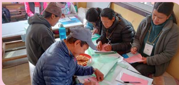
Glimpses of five day's ECED training in Mahendra Jyoti Secondary School in Chaurikharka.