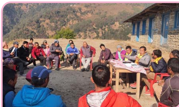
Joint meeting organised at Saraswati Basic School, Hill