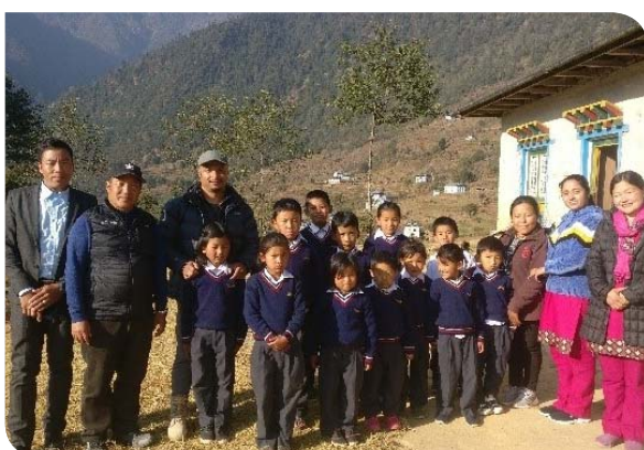
Group photo with students and teachers in Dudhkunda BS, Hewa.