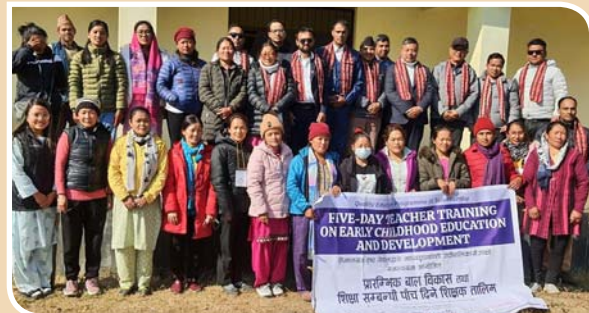
Training participants, guests and trainers in Himalaya Secondary School, Basa.