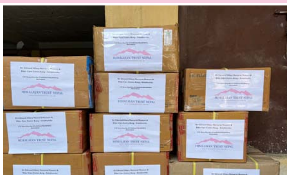
Drugs of Bung clinic.

HTN procured the necessary drugs for Phaplu hospital, Bung and Salyan clinics, and delivered them to the hospital and clinics in February as part of its regular support. The cost of the drugs was supported by Sir Edmund Hillary Stiftung, Germany.