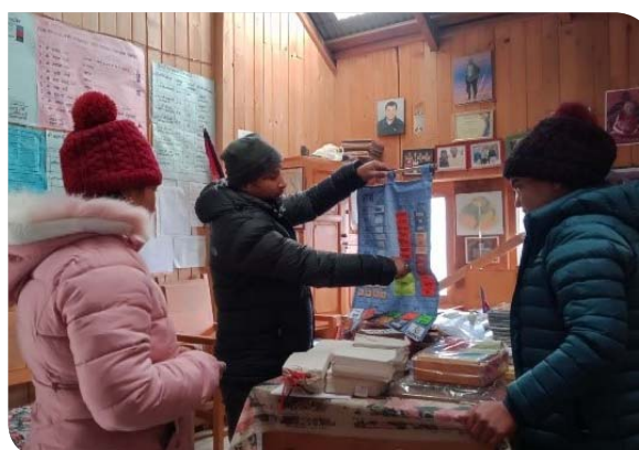
Members of the SBTTP team explaining how to use different ECED materials to teachers at Balbikash BS, Chhulemu.