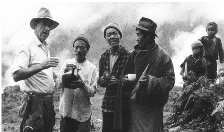
Sir Ed with Sherpas bearing chang and a petition for a school.