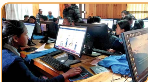
Newly installed power supply in Junbesi Secondary School.

HTN installed a 3 kilowatt solar power system to operate the computer lab in Junbesi Secondary School.