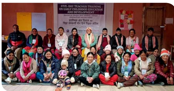
Training participants, guests and trainers in Birendra Jyoti Secondary School, Sotang.