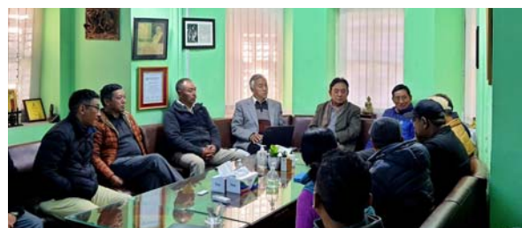
15th Death anniversary of Sir Ed observed in Trust office, Dillibazar.

On 11th January 2023, the 15th death anniversary of Sir Edmund Hillary was observed in Trust office at Dillibazar. Board members including staff of HTN attended the programme. At this meeting, decisions were made on small grants for various educational and community projects for the fiscal year 2023/24.