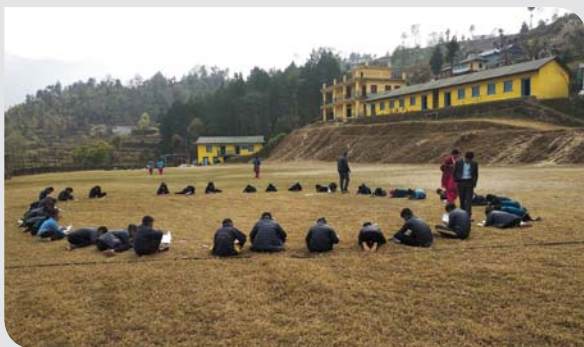
Student assessment grade 2-5 in Phuleli BS, Phuleli.