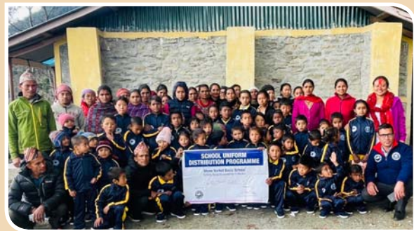
Students and teachers of Narkel BS with new school uniform.