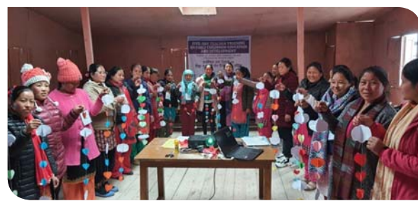
Participants displaying classroom decoration materials prepared at the training.