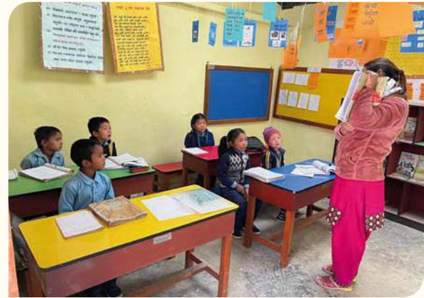
Child-friendly furniture supported to Solukhumbu schools.