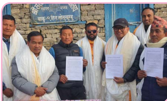
MoU signed for the implementation of day meals for students and teachers of Saraswati BS, Hill.