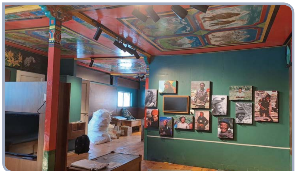
Sir Ed Visitor Centre in Khumjung.