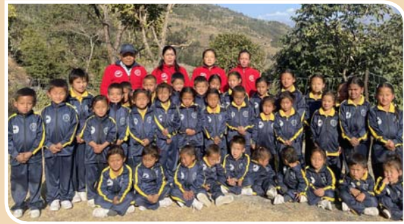
Students and teachers of Toshkham BS with new school uniform.