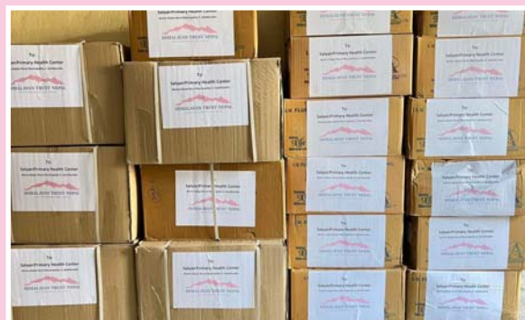
Drugs of Salyan clinic.