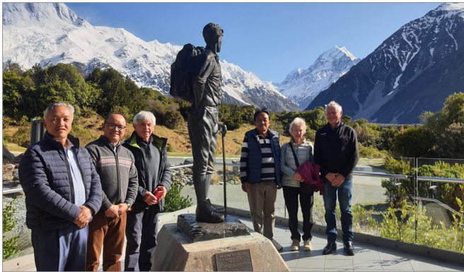
⇒ HTN team visited Mt. Aoraki/Cook.

During their visit, the team also visited Christchurch, Geraldine and Mt. Cook and met the members and supporters of Himalayan Trust, which included founders of EduTech Nepal, Trustee members of Forgotten Sherpas of Nepal Trust and professors of Lincoln University.