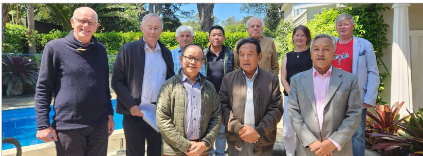
⇒ HTN team with Board members of HTNZ.