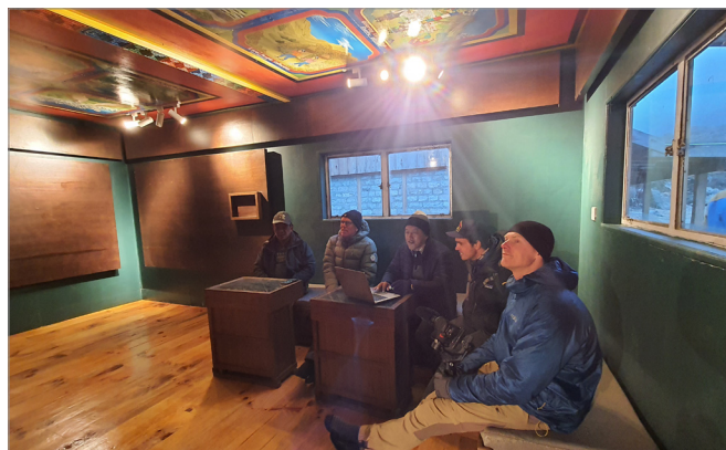
⇒ Visit to the Sir Ed Visitor Centre in Khumjung.