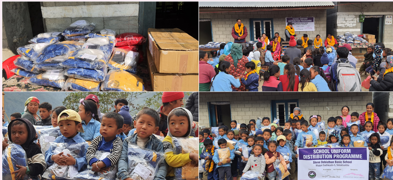
⇒ School uniform distribution programme held in Debisthan Basic School.