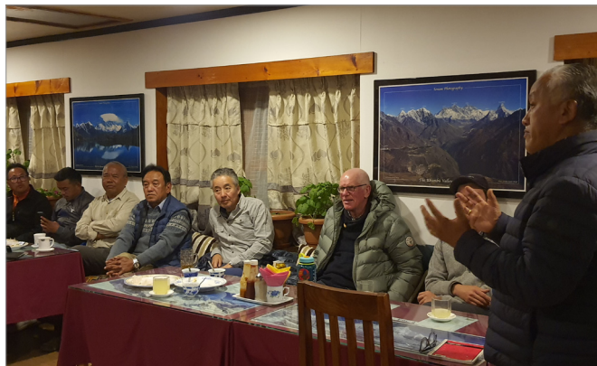
⇒ HTNZ, HTN, AHF and EduTech Nepal teams local leaders attended a dinner programme at Namche.