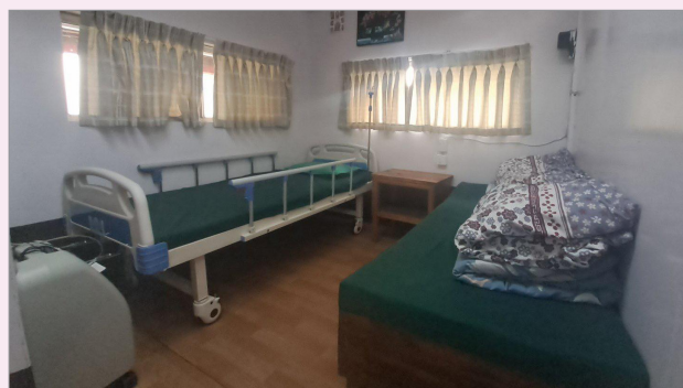
⇒ ICU manual bed installed in Khunde hospital.