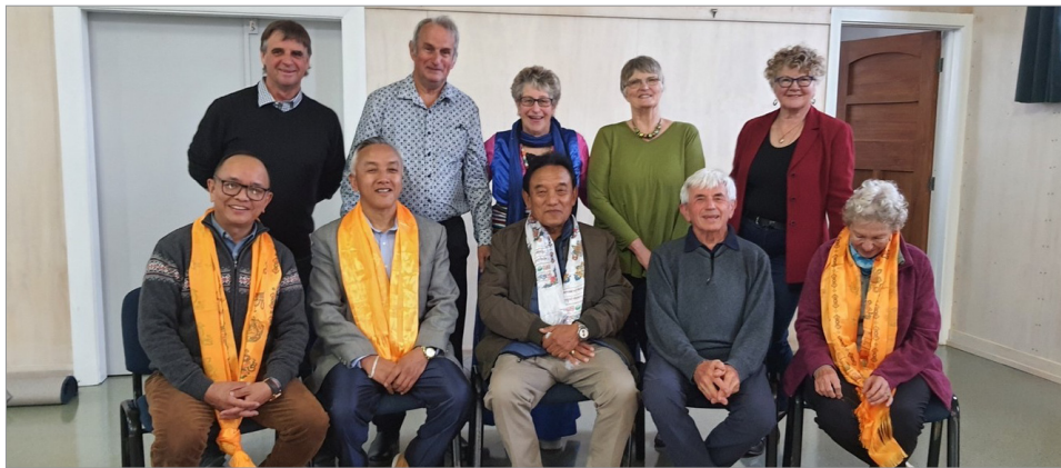
⇒ HTN team with the Trustee members of FSNT.