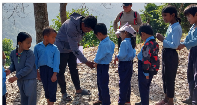
⇒ Parents at Amarjyoti BS of Mapya Dudhkoshi RM facilitating in children's hygiene and sanitation.