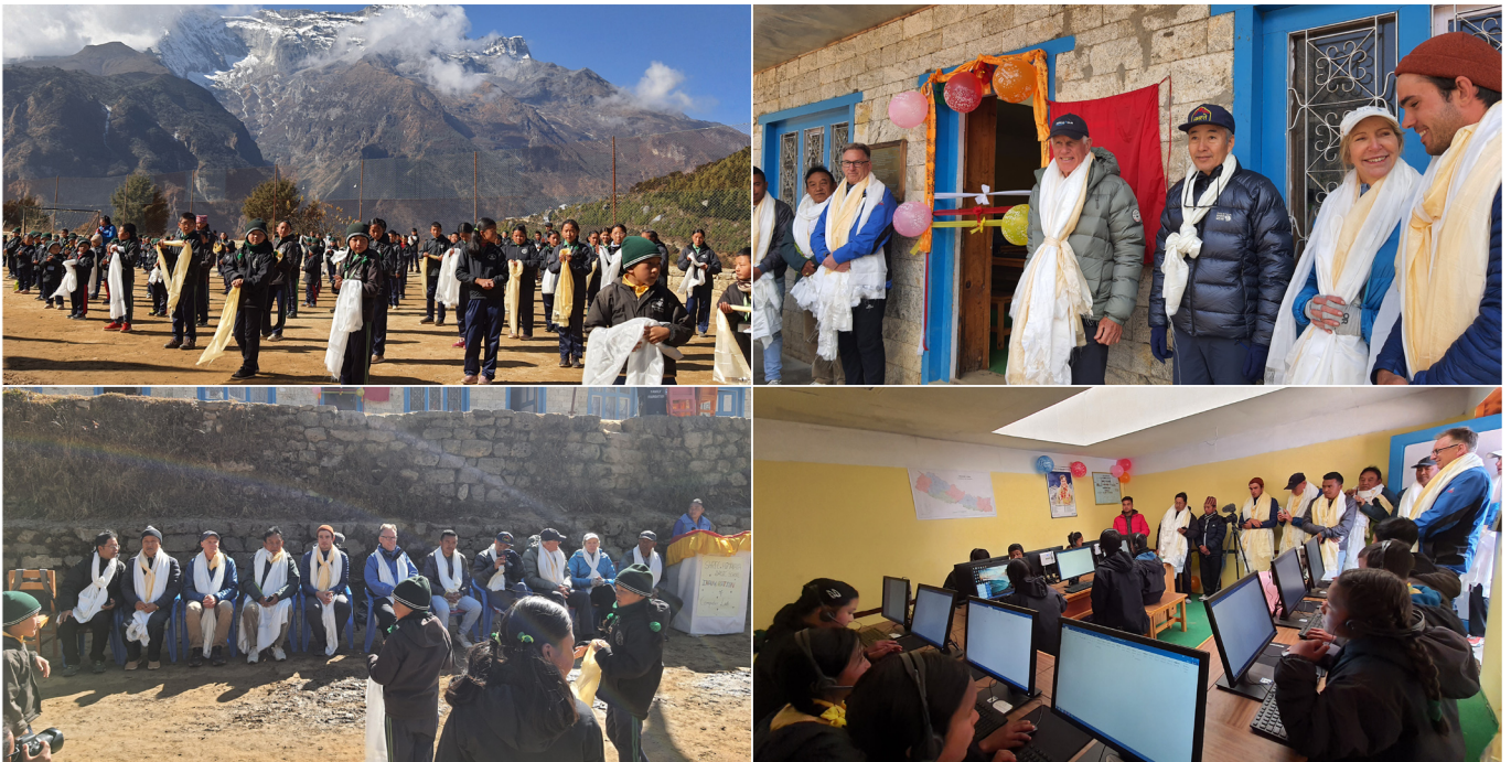
⇒ Computer lab inauguration programme in Himalaya Basic School, Namche.

Stone jointly inaugurated the computer lab installed at Himalaya Basic School, Namche on 11th November 2022.