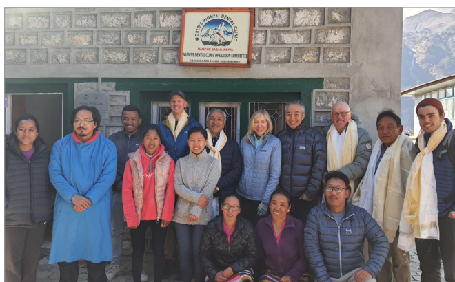
⇒ Namche Dental Clinic visit.