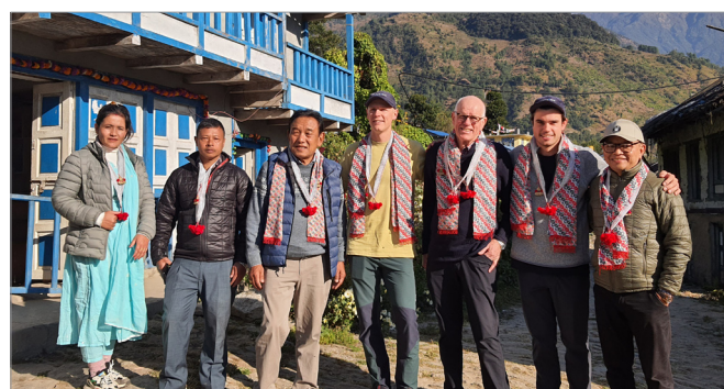
⇒ The team at Bung.