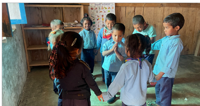
⇒ Students at Narkel BS, Sotang learning to greet with Namaste.