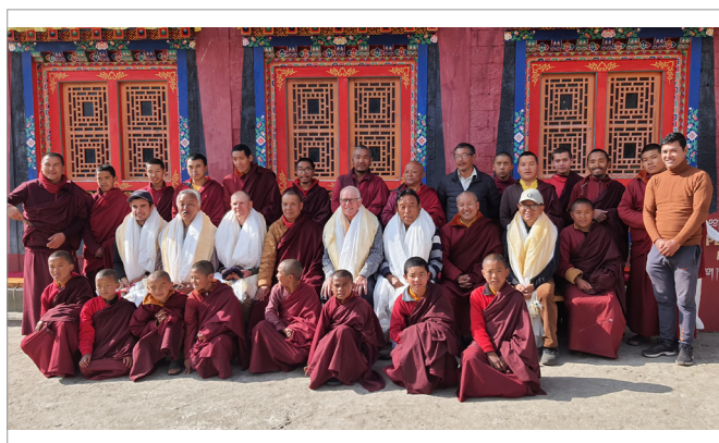
⇒ Pema Chholing Monastery visit in Thulo Gumela.