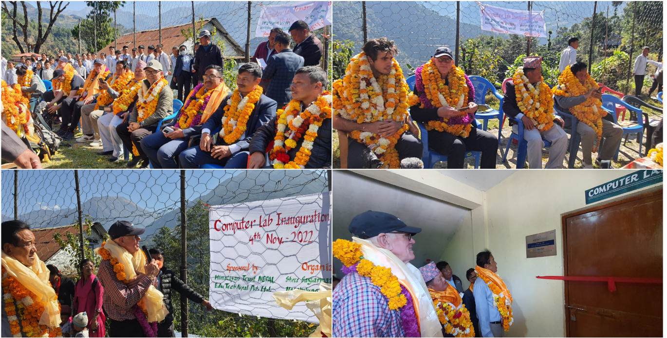
⇒ Computer lab inauguration programme held in Sagarmatha Secondary School, Bung.

installed at Sagarmatha Secondary School, Bung on 4th November 2022.