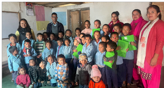
⇒ LIL Education Field Officer with students and teachers of Narkel BS, Sotang.