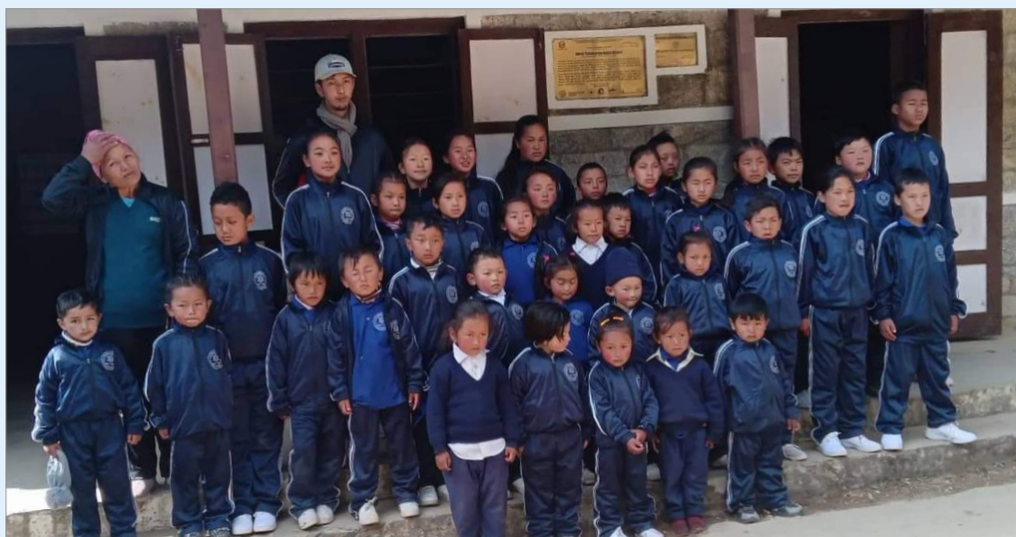
⇒ Students wearing the uniform set.