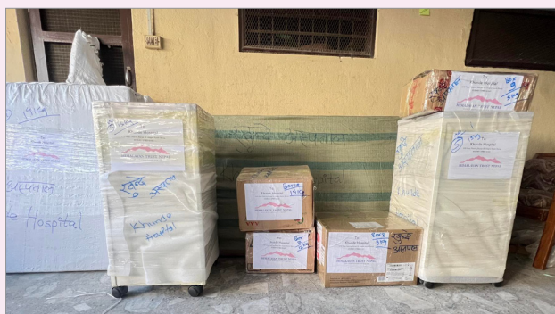
⇒ Hospital equipments ready for dispatch.

HTN purchased hospital necessities including ICU manual bed with mattress, cardiac monitor with touch screen, lead jacket and bed side locker and transported to Khunde hospital. The operation and management cost of Kunde Hospital has been supported by the American Himalayan Foundation and Himalayan Trust New Zealand.