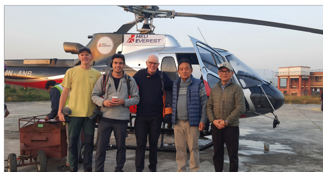
⇒ HTNZ/HTN team at airport before flying to Bung.

During the visit, the team visited 22 schools, 3 hospitals, 3 clinics and 1 water supply project.