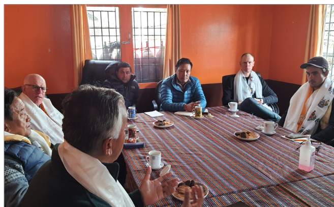
⇒ HTNZ & HTN team made a courtesy call to KPLRM office in Chaurikharka.