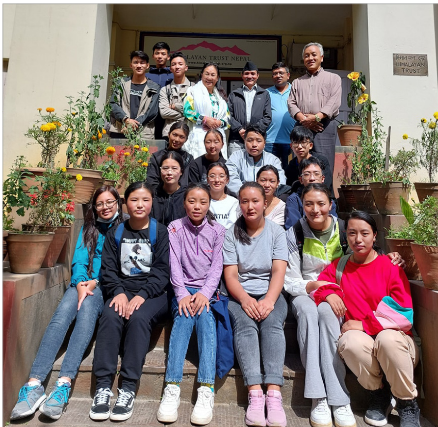
⇒ Students interaction programme held at Trust office.