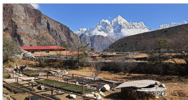
⇒ Thame Forest Nursery.