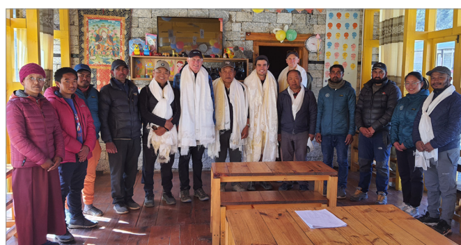
⇒ The team visited Thame Basic School