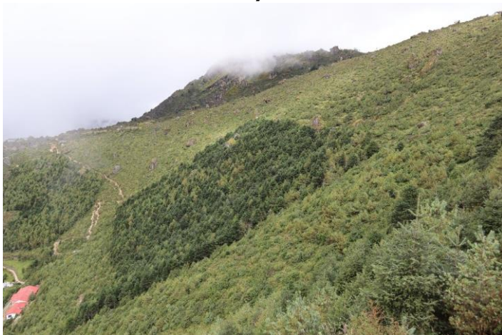
Few glimpse of HT afforestation program nearby Namche.