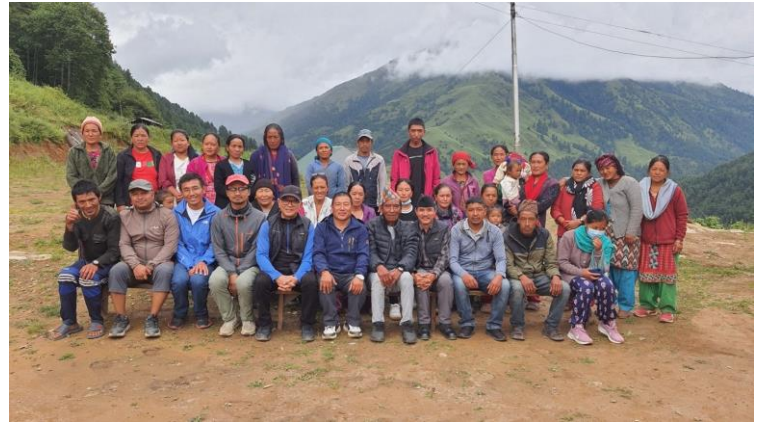
Group photo session with teachers and parent at Seti Devi BS, Charghare.