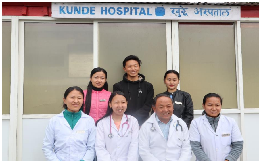
Group photo of Khunde hospital team.

The major objectives of their visit were to capture video interviews of Khumjung School graduates, class-wise group photographs of the students and teachers of Khumjung School, organize a class project such as art competition, plantation program, cleanup campaign etc. They also visited Khunde hospital and Namche to take photographs and videos of the various projects of the Trust.