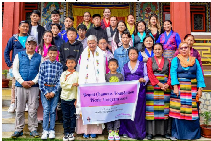
Group photo of the BCF annual picnic and 26 th Anniversary celebration.