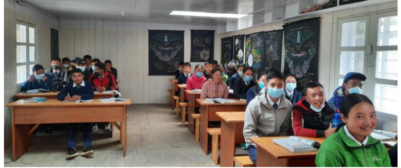
Visit to Khumjung School.