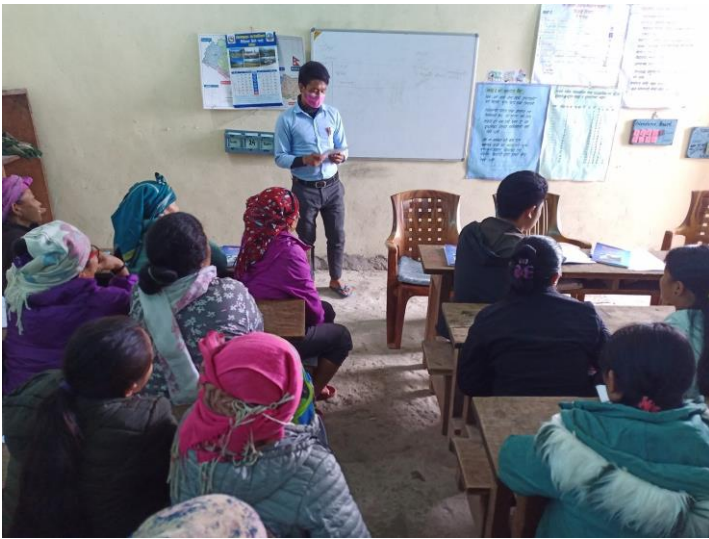
Parents interaction in Khiraule Basic School.