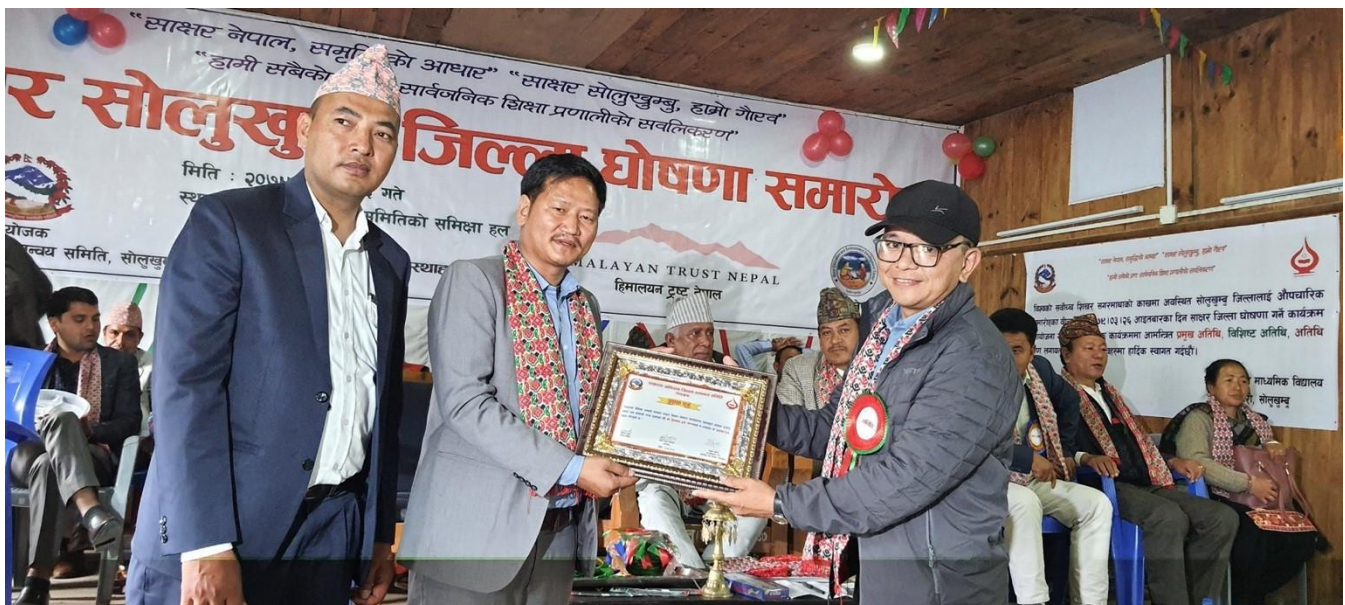
Receiving Appreciation Certificate for Himalayan Trust's contribution in declaration of literate Solukhumbu.

Solukhumbu has been declared as a literate district amidst a formal programme organized in Salleri on 10th July 2022. The district has 96.73% literacy rate and it is the 58th literate district of Nepal. The programme was organized by District Coordination Committee, and Education Development & Coordination Unit Solukhumbu. At the programme, an appreciation certificate was conferred to Himalayan Trust for its six decades' contribution to Education including increasing literacy in Solukhumbu.