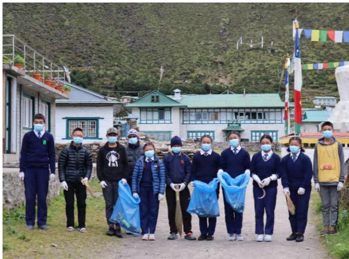
Clean Up Campaign organized nearby Khumjung Secondary School.