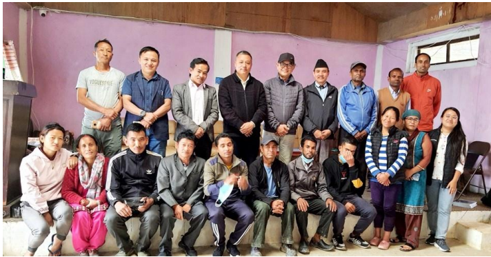
Group photo session after the meeting at Mapya Dudhkoshi Rural Municipality.