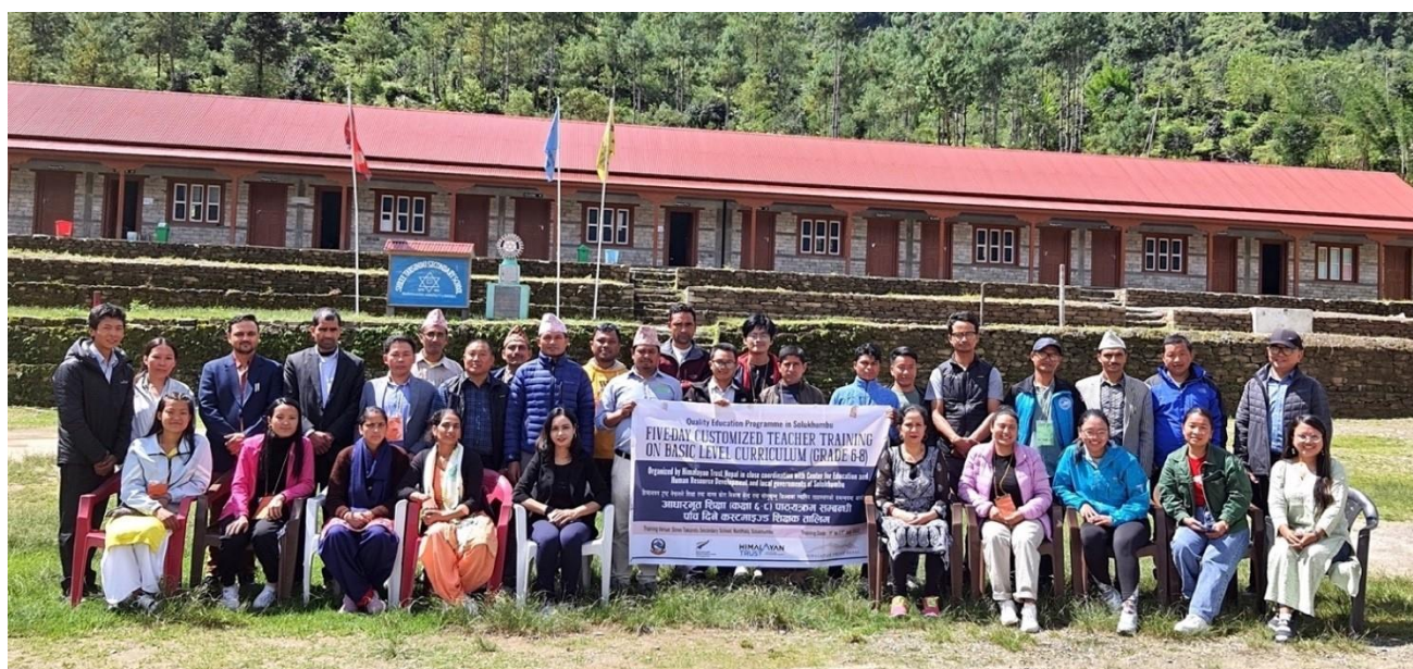
Group photo of English and Nepali subjects Training.

Himalayan Trust Nepal organized two five day's teacher training at Taksindu Secondary School in Solukhumbu. The training was organised in two phases. The first phase of the training was conducted for Nepali and English subject teachers from 9 to 12 July. Likewise, the second phase training was targeted for Mathematics and Science subjects teachers. It was conducted from 16-19 July 2022. A total of 51 teachers (9 female/42 male) from 17 different schools attended the training.