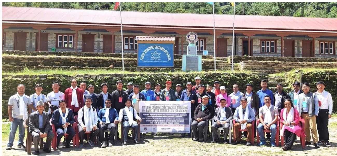
Group photo of Science and Mathematics subjects Training.