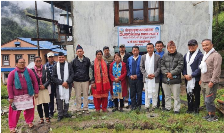
Group photo session after the meeting at ward 2 office, Solududhkunda Municipality.