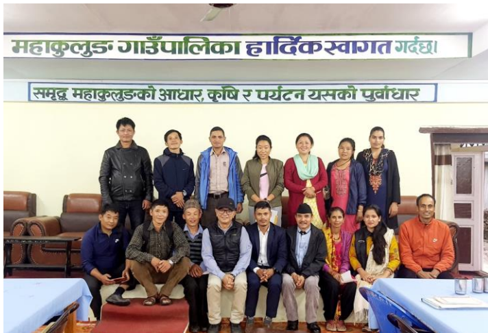
Group photo session of head teachers, Rural Municipality Officials and HTN Team.