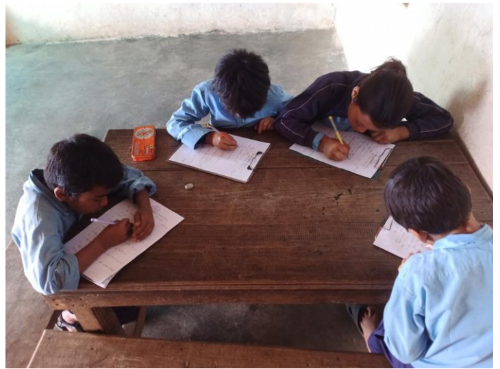
Students of Narkel Basic School busy in their written test.