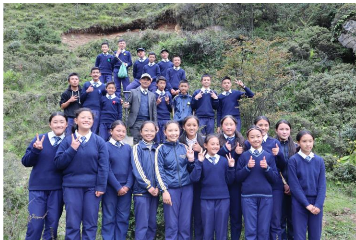
Plantation program organized for grade 8 students of Khumjung Secondary School.