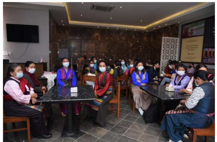
Parents and children's participation during the programme.