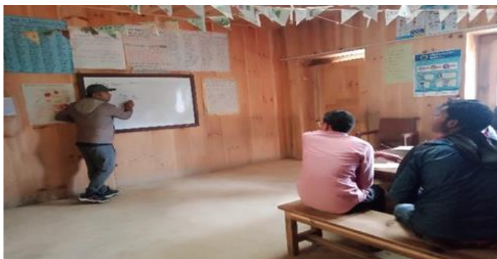
Grades 4-5 Evaluation workshop at Fera Basic School.

The SBTTP team travelled to Solududhkunda Ward No. 2 and 3 from 20 th August to 17 th September 2022. The objectives of their visit were focused on facilitating the implementation of Grades 1-3 Integrated Curriculum, providing follow up support on Grades 6-8 Centre Based Teacher Training content sharing, developing Model Question, use of Specification Grid, Rubrics, Assessment, conducting meeting with SMC/PTA and Head Teacher, meeting with local government representatives and head teachers of Solududhkunda Municipality Ward No. 2. In partnership with local government, HTN and the schools in ward 2 of Solududhkunda Municipality, the National Children's Day was celebrated on 14 September 2022 at Junbesi Secondary School by organising various events.