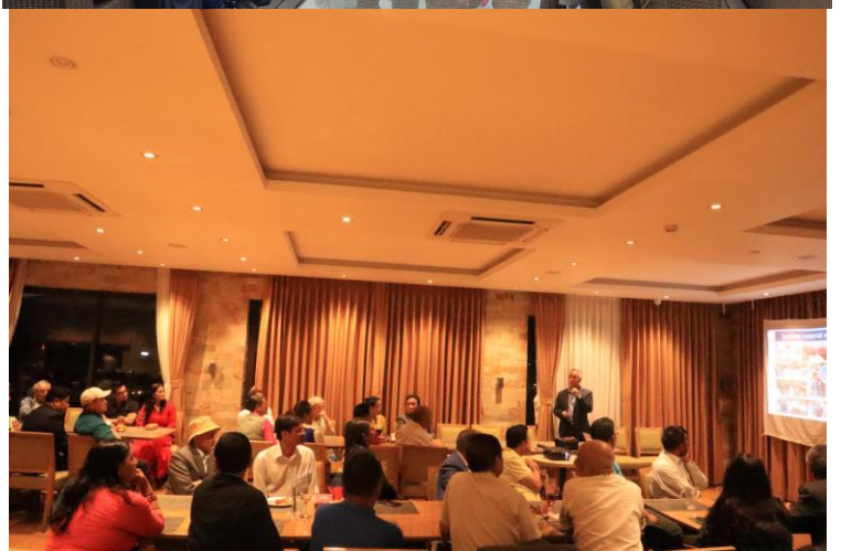
15 th AGM of HTN successfully conducted on 12 th August 2022 in Kathmandu.