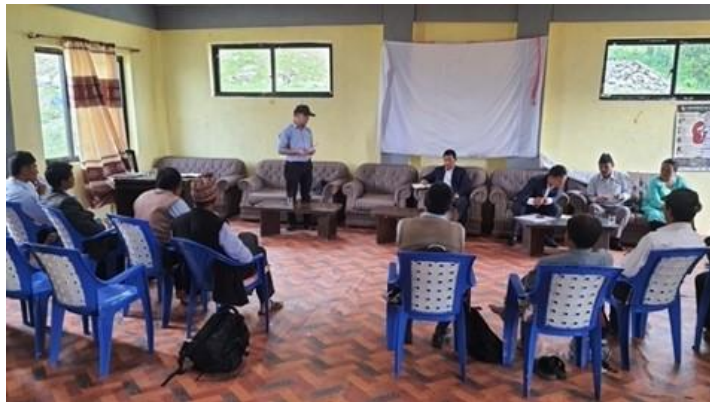
Meeting at Sotang Rural Municipality.

The SBTTP team travelled to Solududhkunda Ward No. 2 and 3 from 20 th August to 17 th September 2022. The objectives of their visit were focused on facilitating the implementation of Grades 1-3 Integrated Curriculum, providing follow up support on Grades 6-8 Centre Based Teacher Training content sharing, developing Model Question, use of Specification Grid, Rubrics, Assessment, conducting meeting with SMC/PTA and Head Teacher, meeting with local government representatives and head teachers of Solududhkunda Municipality Ward No. 2. In partnership with local government, HTN and the schools in ward 2 of Solududhkunda Municipality, the National Children's Day was celebrated on 14 September 2022 at Junbesi Secondary School by organising various events.