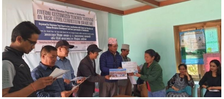
Glimpses of the Training.