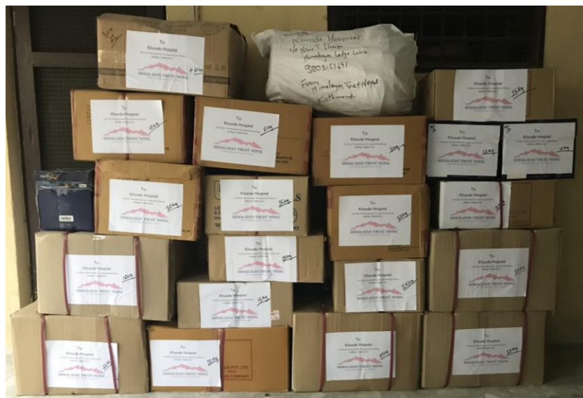
Drugs of Kunde hospital ready for dispatch.