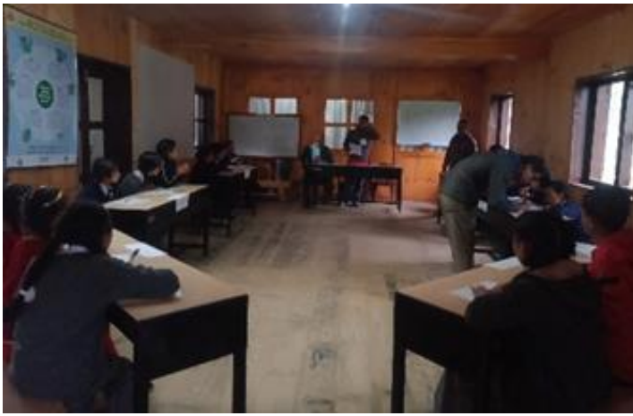
Quiz program at Junbesi Secondary School on the occasion of Children's Day celebration.