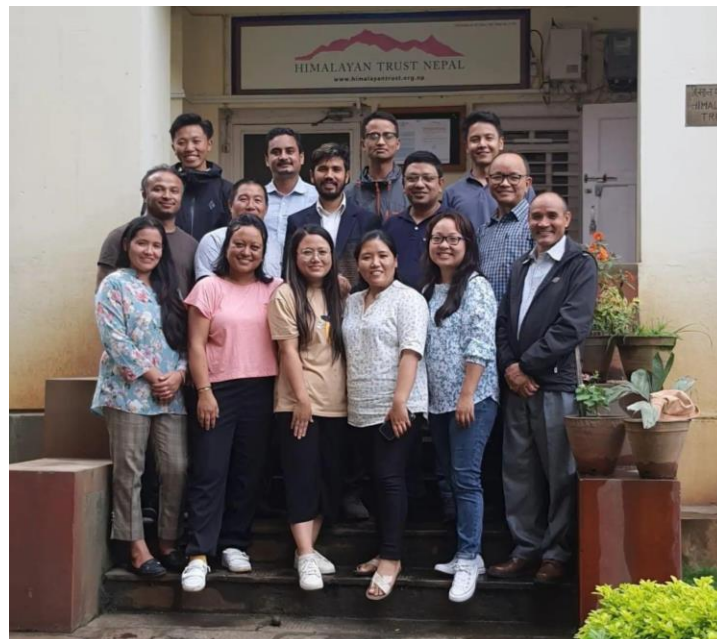
HTN team after completing two-day's basic photography training.

A two day's basic photography training was conducted for the staff of HTN from 31 July to 1 August 2022. The six credit hour course was facilitated by the professional photographer Mr. Santosh Bisunke. The training was attended by 15 staff. The main objective of the training was to learn to capture quality pictures during field visits using hand-held devices such as smart phones.