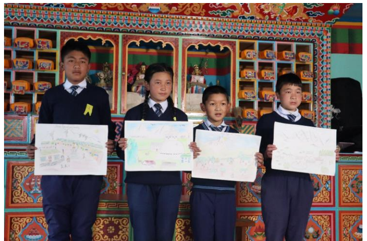
Art competition organized in Khumjung school for grade 4, 5 and 6.