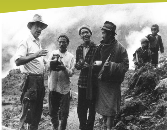
Sir Ed with Sherpas bearing chang and a petition for a school.