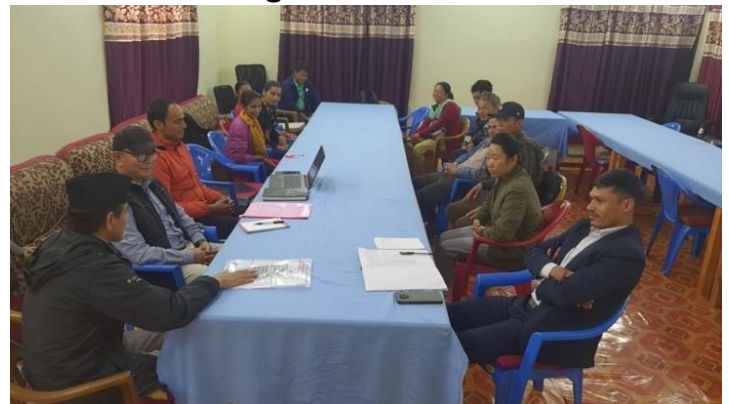
During the meeting at Mahakulung Rural Municipality.