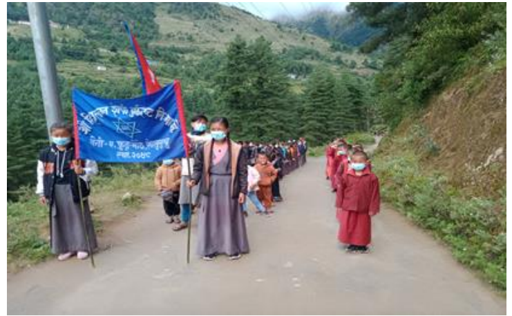
Students ready to celebrate National Children's Day.

The LIL team made their field visit from 3 rd August to 17 th September 2022. The objectives of their visit were to support teachers in the classroom activities, meet with head teachers, SMCs, PTAs, rural municipality education unit and local government representatives for the effective implementation of the project, ensure proper use of Home Reading Log Book, support teachers in coding the reading books, collect project based necessary data from the schools and observe planned model classrooms and collect required information. The team also organised writing skills competition for grade 1-3 children on the occasion of National Children's Day 2022.