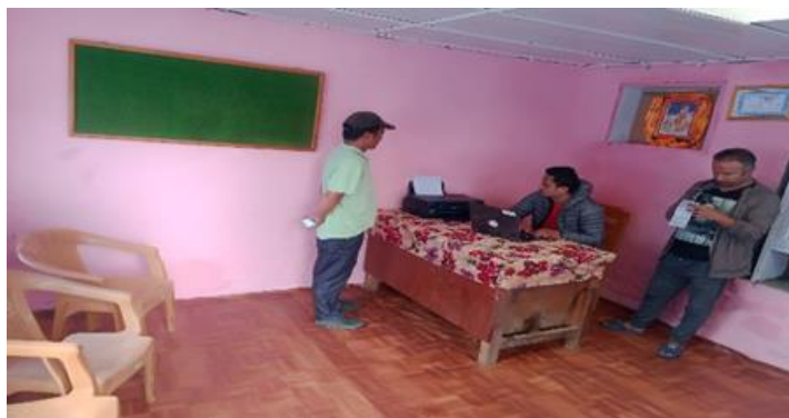
Field office set-up in Phaplu.