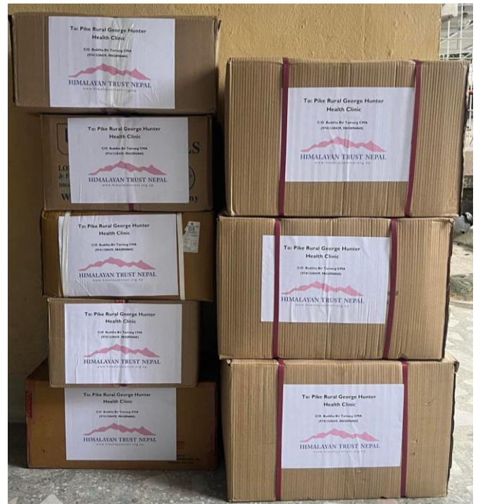
Drugs of Patle and Goli Clinic ready for dispatch.