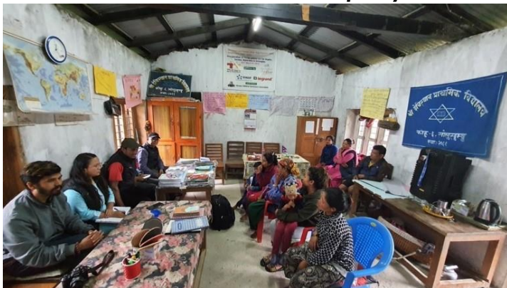
Interaction with parents at Devasthan BS, Mapya Dudhkoshi Rural Municipality.