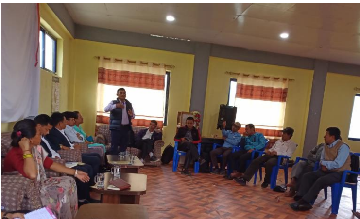
Head teacher's meeting at Sotang Rural Municipality.

The LIL team made their field visit from 3 rd August to 17 th September 2022. The objectives of their visit were to support teachers in the classroom activities, meet with head teachers, SMCs, PTAs, rural municipality education unit and local government representatives for the effective implementation of the project, ensure proper use of Home Reading Log Book, support teachers in coding the reading books, collect project based necessary data from the schools and observe planned model classrooms and collect required information. The team also organised writing skills competition for grade 1-3 children on the occasion of National Children's Day 2022.