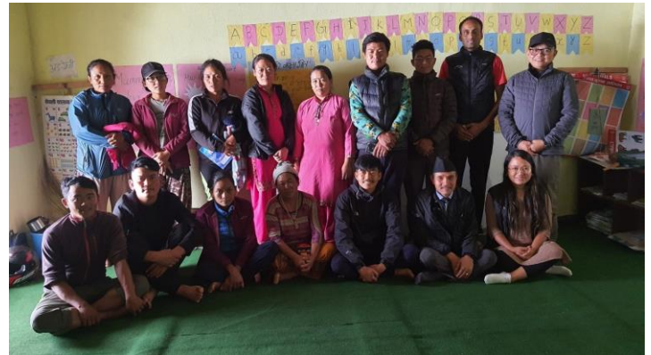
Group photo with teachers and parents at Nava Pragati Basic School.