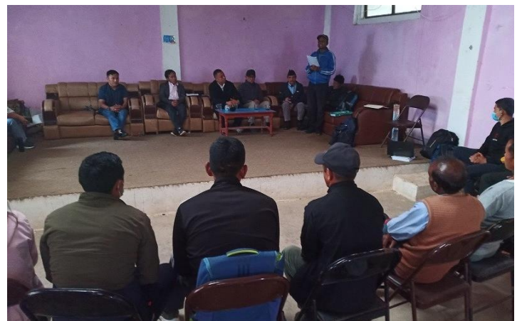
Head teacher's meeting at Mapya Dudhkoshi Rural Municipality.