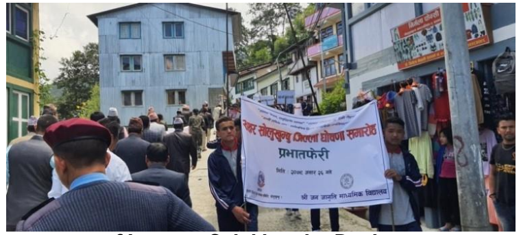
A rally organised in Salleri prior to the formal programme of Literate Solukhumbu Declaration.