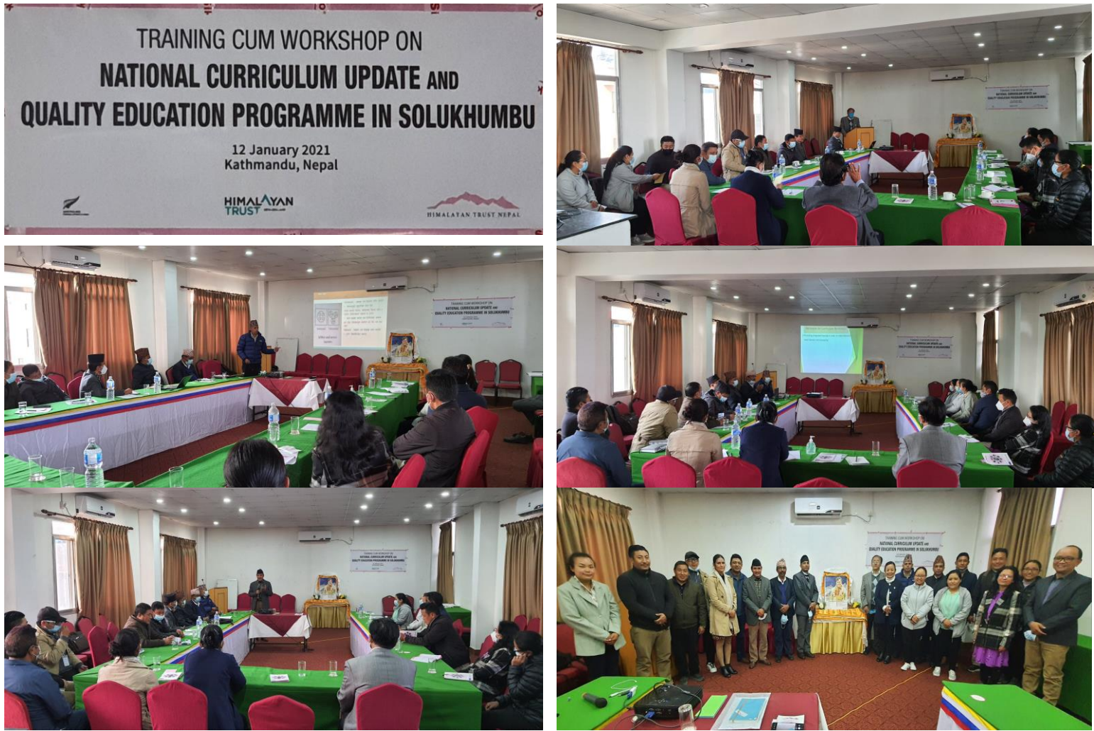
Training cum workshop on National Curriculum Update and Quality Education Programme in Solukhumbu conducted in Kathmandu.