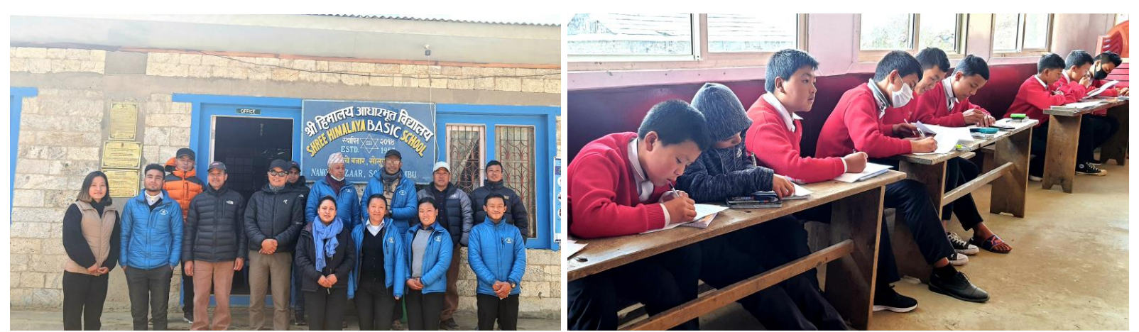
Baseline survey conducted in 16 schools of Khumbu Pasanglhamu Rural Municipality.