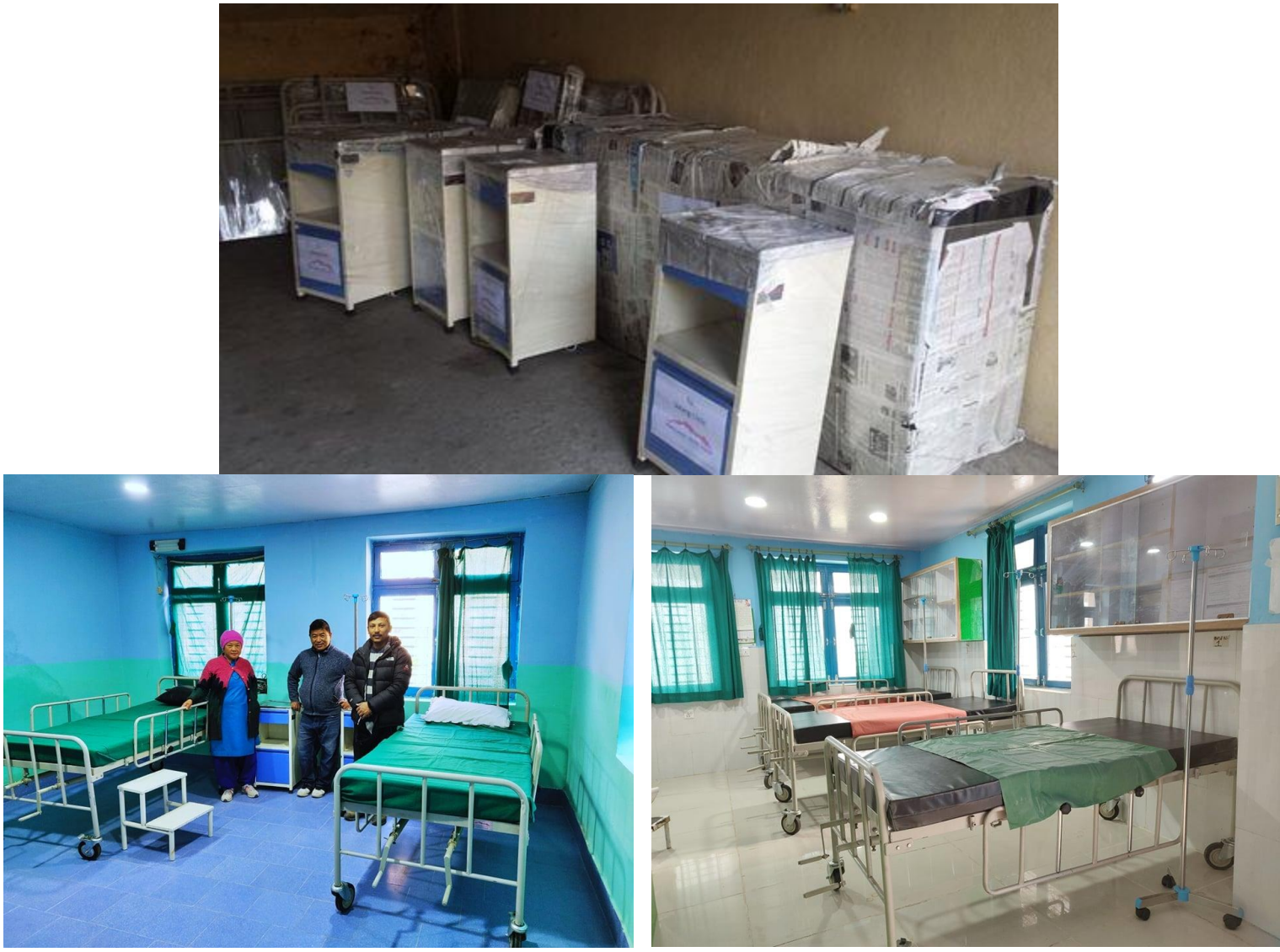
Sotang PHC equipped with the necessary supported materials.