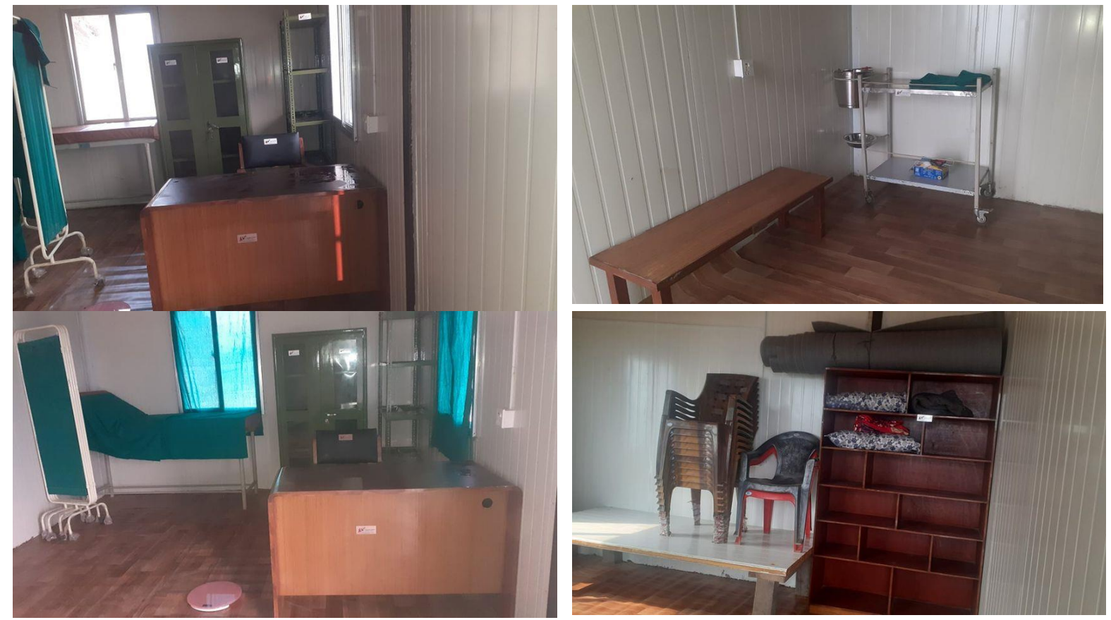
The internal view of the Goli clinic after furnished.

With the funding support of Forgotton Sherpas of Nepal Trust (FSNT), HTN procured furniture and clinical materials for Pike Rural George Hunter Clinic of Goli. The furniture and materials include rack, shelf, table, chairs, benches, patient check up bed, rest bed, carpet, bucket, etc.