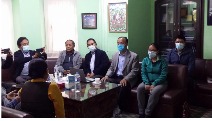
Board meeting held on 10<sup>th</sup> March 2021 at HTN office.